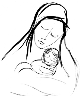
Drawing by Thomas Merton. Used with permission of the Merton Legacy Trust and the Thomas Merton Center at Bellarmino University.

Mother Seton House PO Box 673 Fryeburg, ME 04037